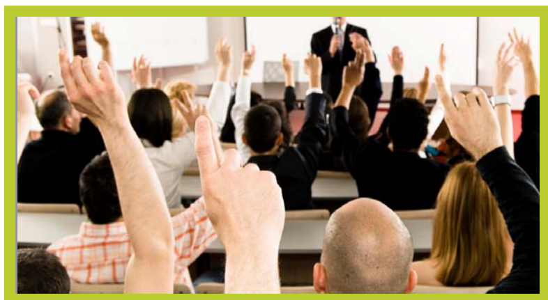
Many individuals want to become Red Cross instructor-trainers. The IT Process helps to ensure that the very best are chosen.

Phase 4 is the Final Disposition of the IT candidate. If all has gone well up to this point, the IT candidate will be authorized as an IT when the Practicum phase is completed. If problems are encountered, a remediation plan may be drawn up to help the IT candidate, or the IT candidate may simple “wash out” of the program. (This rarely happens!)◆